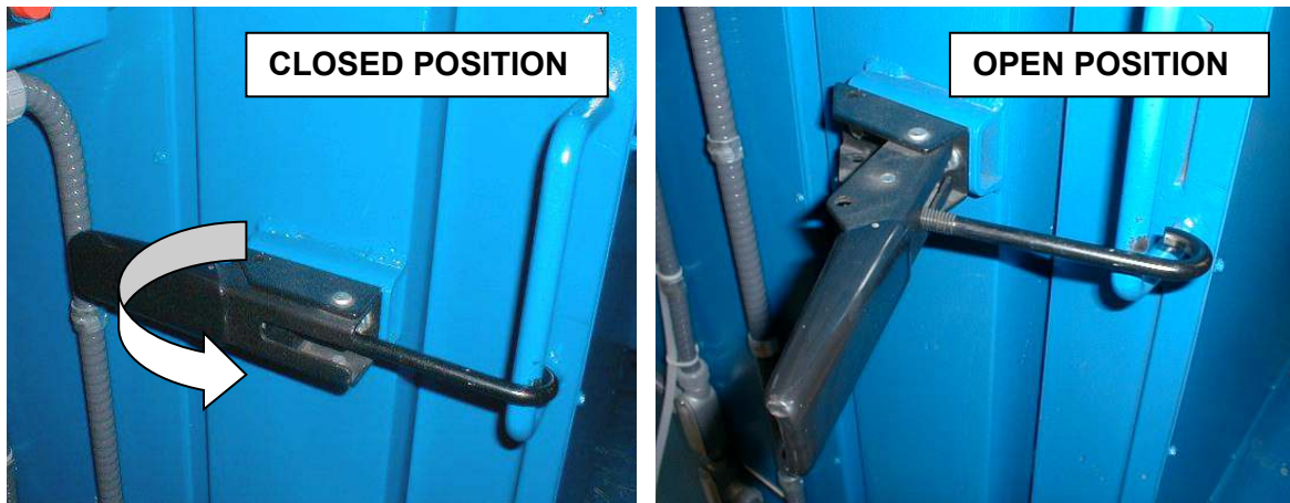
Fig. 3 - 3: Cabinet Door Latch

Position Lock Pull the door open slowly , until it locks in the first position.