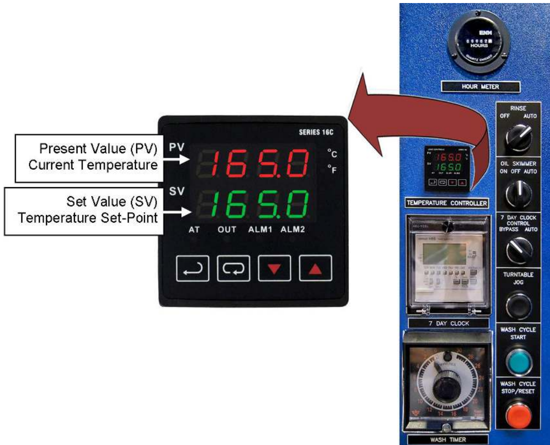
Fig. 3 - 2: Water Temperature Controller & Read Out

Non-scheduled Shift: To run a wash cycle during a non-scheduled shift, use the clock-override switch to bypass the 7-day clock. Refer to the next section.