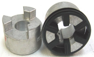
Jaw coupling with hubs and spider.

□ A drive couplings two basic functions are to transmit torque and to allow for a small degree of shaft misalignment between the motor and pump. Elastomeric type couplings can accommodate as much as four times the misalignment than jaw type couplings. The term “Flexible Couplings” derives from the degree of flexibility designed into couplings to accommodate misalignment. MART Power Washers use two basic types of flexible couplings. Jaw couplings and Elastomeric flexible couplings.