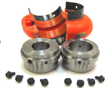
Elastomeric coupling with hubs and flexible element.

Permanent compressive set occurs as the spider ages in service; a 25% reduction from original thickness signals the time to replace the elastomeric spider. Get more out of your elastomeric spider! When the spider begins to wear, just advance it one “leg” between the hub jaws. Because the pump only rotates one direction, just three of the legs transmit torque and only every other leg is worn.