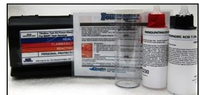
Titration Kit #22205